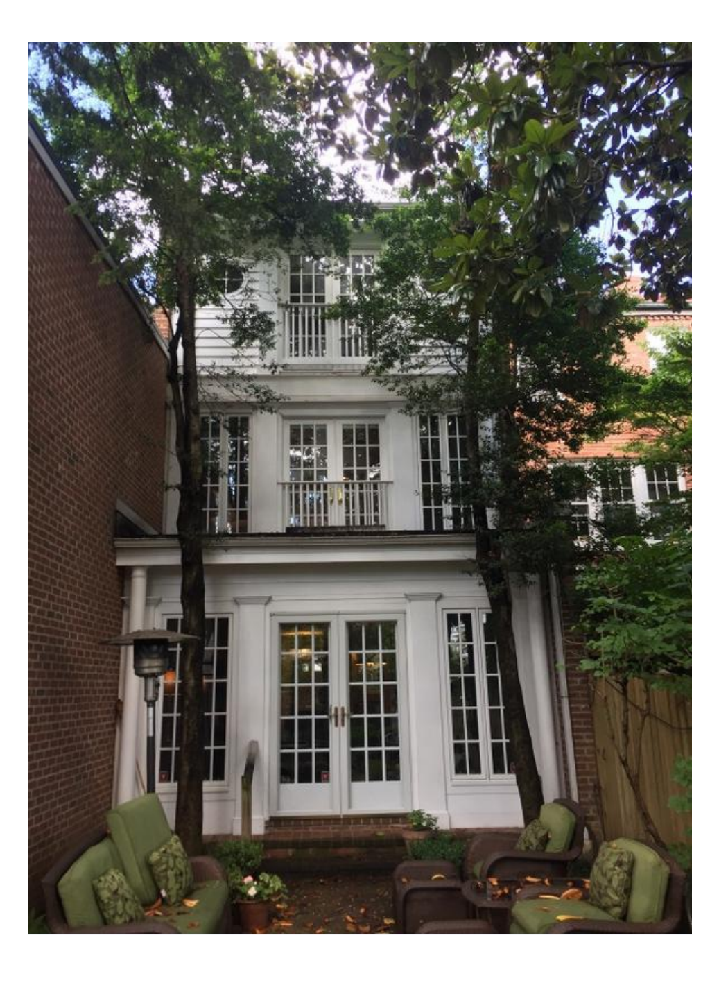
PHOTO OF FRONT ELEVATION OF SUBJECT PROPERTY IN THE MIDDLE WITH THE TWO ADJACENT PROPERTIES (1614 AND 1612 34TH ST NW)