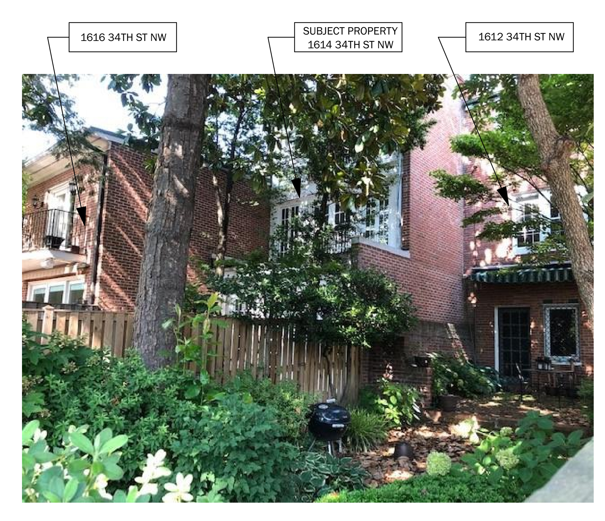
PHOTO OF REAR ELEVATION OF SUBJECT PROPERTY IN THE MIDDLE WITH THE TWO ADJACENT PROPERTIES (1614 AND 1612 34TH ST NW